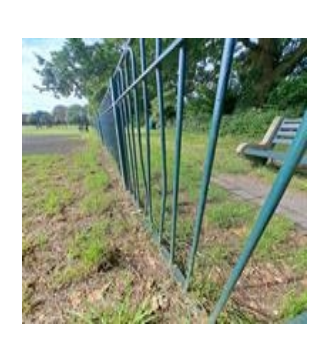
Item - Bent - Task