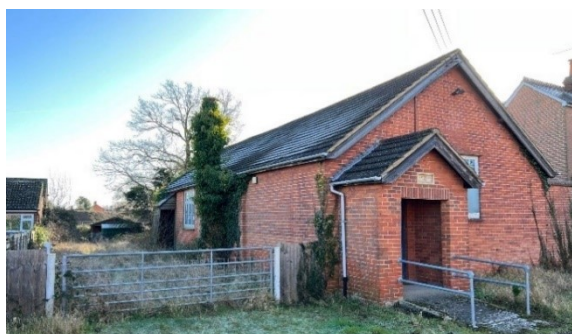
Garth Club, St John's Road, Mortimer