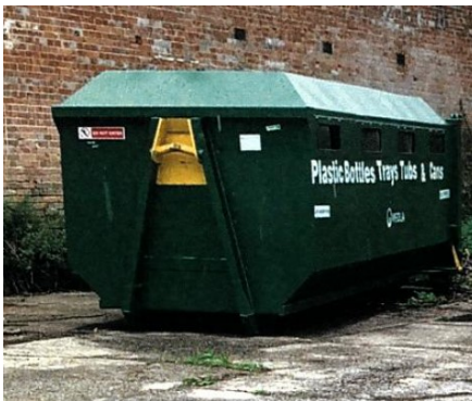
Mini recycling bank (this one is at East Garston)

The council continues to seek sites for mini recycling bins that would allow residents to drop off items not currently collected via doorstep recycling, for example plastic food trays. The Mortimer Co Op site manager kindly explored an option there, but it was not approved. The Mortimer school federation is keen in principle, but probably does not have space. Burghfield parish council has suggested land owned by the Asda/Pinewood fuel station, which I will follow up. If you or your group has any ideas of where one could go, please get in touch.