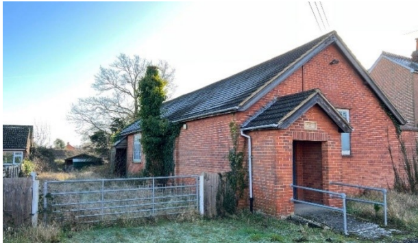
Garth Club, St John's Road, Mortimer