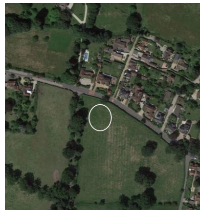
Proposed site of school drop-off/car park

Following an enquiry/concerns from residents I have asked the governors for their appetite for a 20mph zone outside the school during school drop off/pick up. I've also been in touch with the Highways team and the school governors on the area around the school generally