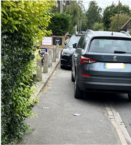
Mortimer's missing pavement