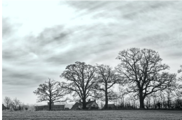
Beech Hill (image Beech Hill Parish Council)