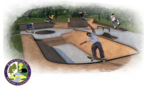
Burghfield 'Skate Park 2.0'