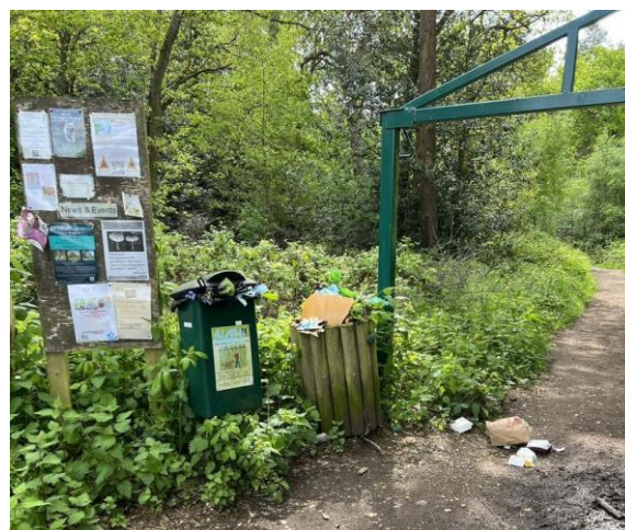
Figure 1: Bunces Lane, Wokefield

After the excitement of the election, I came down to earth quickly when reading, albeit from a safe distance of a foreign holiday, via Facebook, residents' concern over uncollected general and dog waste from bins in Burghfield Common and Wokefield. It was clear that many residents had reported the problem and that Burghfield Parish Council's clerk was chasing the relevant teams regularly. One resident had even emptied a Rec. bin himself and took the rubbish home. The reason for the delay emptying is that a member of staff left, and their replacement needed some time to get to grips with the rounds and all the bin locations. For the avoidance of doubt, the council knows where they are and has systems that track the emptying and monitor the web site for reports of full bins. Apparently in the district overall we make about 500 bin collections per week. Most of the Burghfield general and dog bins were belatedly emptied before the late May Bank Holiday but unfortunately those at the end of Bunces Lane (part of Wokefield), pictured, were missed. After I spoke with the Countryside team earlier this week, they met their contractor. I am assured those bins will be emptied imminently (by 1 June). To summarise the general advice: