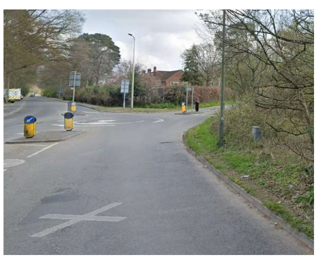
Google Street View, cited December 2021

Pursuant to West Berkshire Council's preapplication advice (September 2021), I intend to provide you with a full and accurate survey of all trees within influence of the route, confirming constraints which may have a bearing on the proposal and risk.