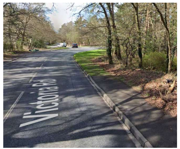
Google Street View, cited December 2021

For the purposes of this quote, I understand the preferred route will be per Ridge Drawing 501459-RDG-XX-XX-DR-C-0002. By way of land to the east of the Reading Road, I note the route connects the extant footway on Victoria Road to its south and that at the Padworth Road/Reading Road/Goring Lane junction to its north (per the respective inserts below).