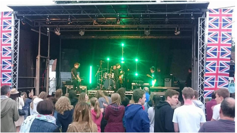
State 51 perform on stage.