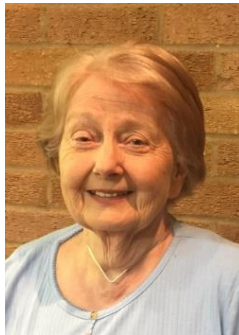
Mollie Lock Fairground; Roads