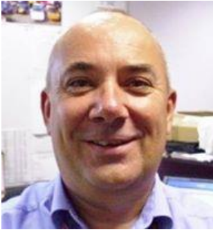
Mick Johnson Cemetery; Fairground; Roads