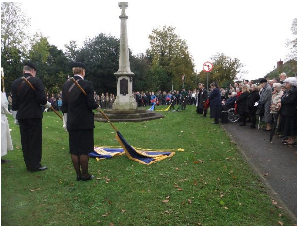
The Service last year

This will take place at the War Memorial on Sunday 13 th November starting as usual at about 10:45.