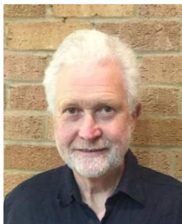
John Bull Cemetery; Fairground; Roads