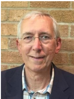
Pat Wingfield Cemetery; Fairground; NDP Implementation*