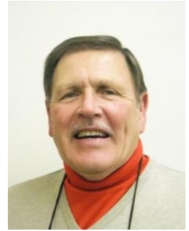
Neil Kiley Cemetery*; Fairground; NDP Implementation; Planning