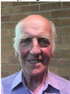
Phil Challis Cemetery, Fairground; Planning