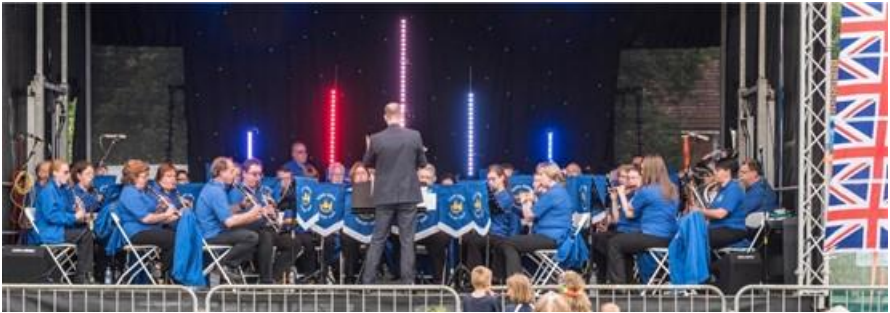
South Berkshire Concert Band