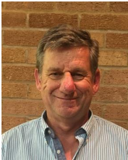
Chris Lewis Cemetery; Communications; Roads