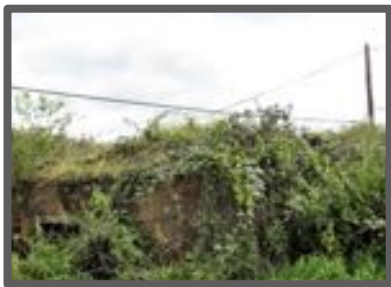
WWII Pillbox on the Heritage Trail.

The idea was that these projects should be actioned once the NDP was given the go ahead in the referendum but some preliminary work has already taken place. So, for example, the first Heritage Trail leaflet has been produced and is now available from the library and Baobab. The leaflet is