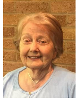
Mollie Lock Fairground, Trees & Amenities; Roads, Footpaths & Commons