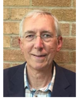
Pat Wingfield Cemetery*;Fairground Trees & Amenities