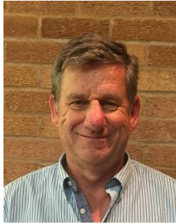
Chris Lewis Cemetery; Roads Footpaths & Commons; Communications