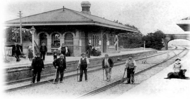
Figure 1; Mortimer railway station

Turn right and walk towards the mini roundabout. To your left is the white Pumping Station (6) that supplies Mortimer's drinking water from a borehole that goes down to the chalk 250 metres below. If you look across the fields behind the pumping station, you can just make out the roof of the Great Barn at Great Park Farm. This was a stud farm for the breeding of heavy horses during the Wars of the Roses. It was part of the Manor of Mortimer that Henry VIII gave to each of his six wives in turn as part of their dowry. Not many of them lived to enjoy it. At the roundabout turn left and walk up the hill to the Railway Station (7) on your right.